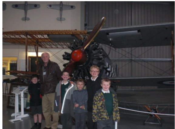
Trip to the Jet Age Museum at Staverton