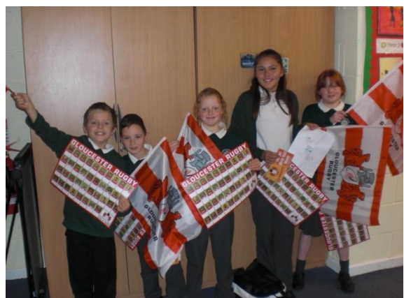
Gloucester Rugby Trip