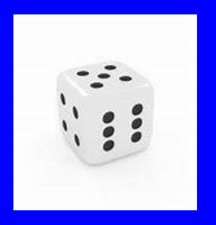
Subitising (recognising quantities without counting) up to 5.